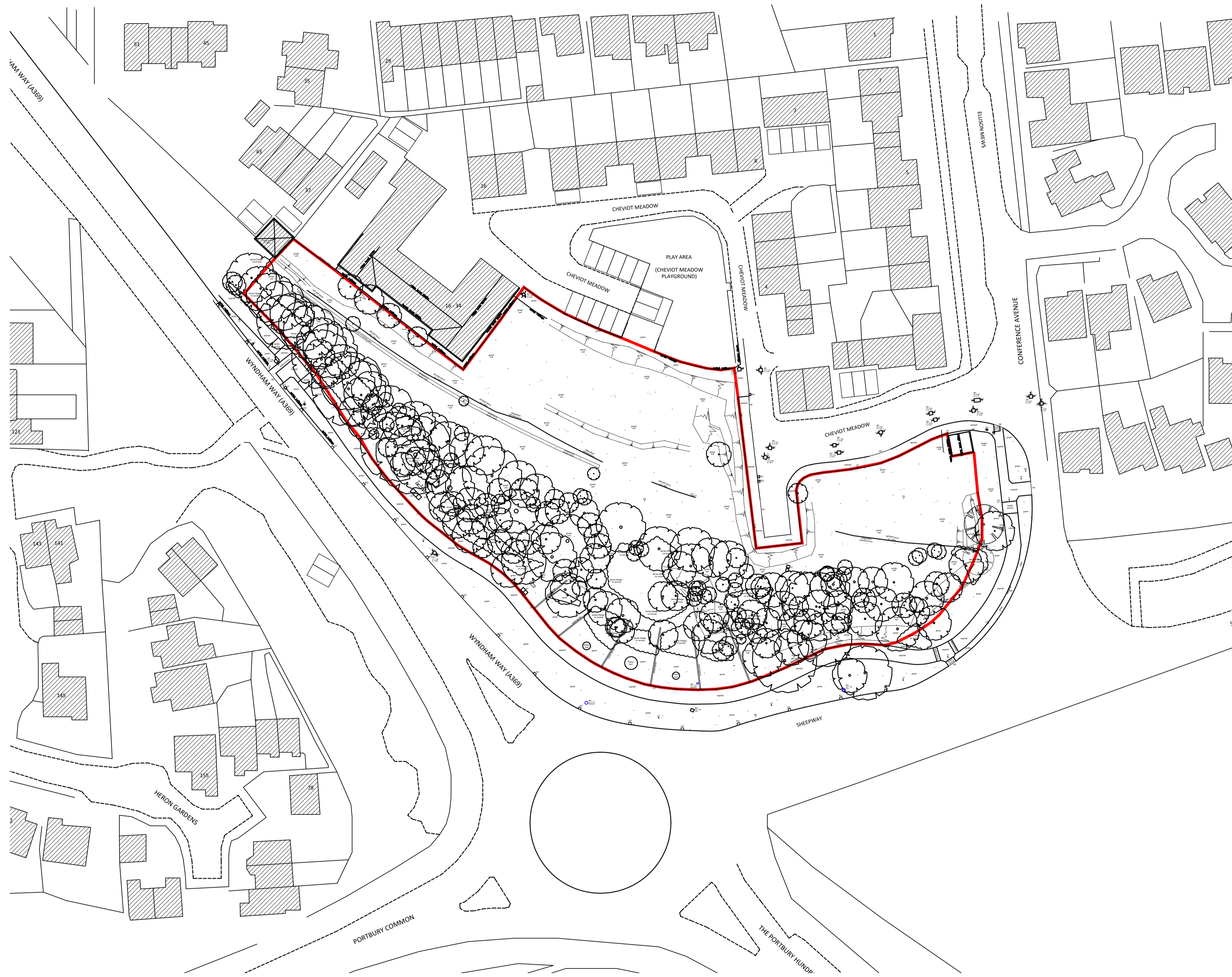
A-887 PORTISHEAD, BRISTOL SITE PLAN 1:500@A1